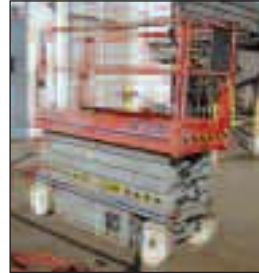
Skyjack Scissor Lift