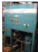
Refrigerated Air Dryer