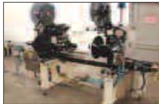
Weber Label Makers