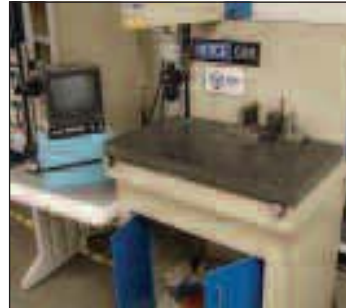
Boice Coordinate Measuring Machine