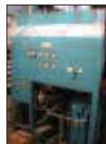
Refrigerated Air Dryer