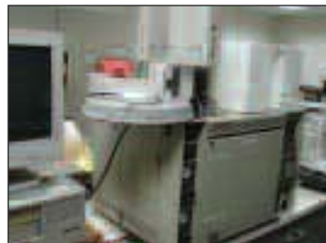
Hewlett Packard Gas Chromatographs