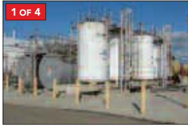
(4) 3,000 Gallon Vertical Storage Tanks

300,00 GALLON WATER STORAGE TANK (4) 3,000 GALLON VERTICAL STORAGE TANKS, w/Mixers (5) 20,000 GALLON HORIZONTAL STORAGE TANKS, w/(4) 5,000 Gallon Compartments 12,000 GALLON VERTICAL FIBERGLASS TANK 10,000 GALLON HORIZONTAL FIBERGLASS TANK 500 & 1,000 GALLON MIXING TANKS LIGHT WATER STORAGE SYSTEMS, (6% ATC) 240 HP CUMMINS STANDBY WATER PUMP PUMPS, MIXERS, VALVES, PIPE & CONTROLS APPROX. 5,000 GALLONS #2 DIESEL FUEL