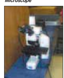
Nikon Imaging Microscope