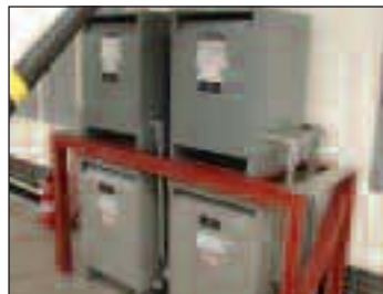
GE, Challenger & Square D Transformers