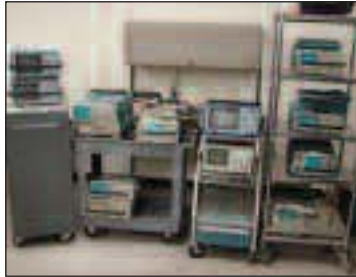
Textronics, HP & LeCroy Oscilloscopes

TEST EQUIPMENT, Including: Torx, Altec, Pyrometers, Tachometers, Temp Probes, Phase Testers, Simulators, Rosemont Interfaces, Load Cell Testers, Air Velocity Meters, Electrical Control Systems, Drives, Backups, Cables, Spare Parts