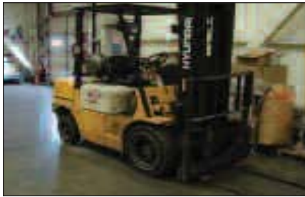
Hyundai 4,800# Forklift

UTILITY TRAILER, w/#2 Diesel Tank & Pump