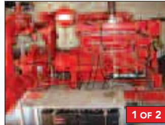
240 HP Cummins Standby Water Pump