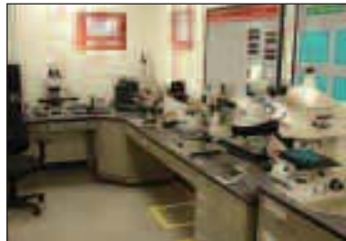
View of Microscopes