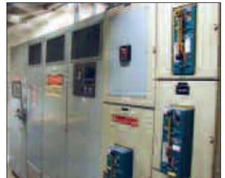
Asco ATS Emergency Switch Control Panel