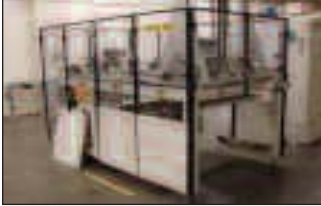
Gruppo PRB Palletizing Machine