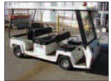
Cushman Facility Maint. Cart