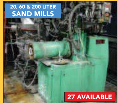
Netzsch Wet Batch Media Milling Machine