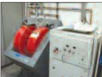
Walker Scientific Magnetometer

BYK GARDNER CONE & PLATE VISCOMETER THERMOLYNE 1,200 DEGREE LAB FURNACE, Mdl. 48000 SETRA HIGH RESOLUTION COUNTING SCALE, Mdl. Quick Count BROOKFIELD DV-E VISCOMETER THERMAL ELECTRON REFRIGERATED RECIRCULATOR, Mdl. CFT-300 UNITRON AIRBLEED TESTERS BRANSON ULTRASONIC CLEANERS LABCON LAB HOODS SIMPLEX CLEAN ROOM SYSTEMS OMEGA SONICS ULTRASONIC CLEANING CABINET, Mdl. OMG-503824X, S/N AGOMO5038 CLESTRA CLEANROOM TECHNOLOGY CLEANROOM FILTRATION SYSTEM HOTPACK LAB OVEN, Mdl. 7303, S/N 33066 SCIENTIFIC AIR SYSTEMS AIR SHOWER, LABORATORY SUPPLIES