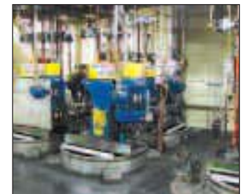
Hockmeyer Mixers & Kettles