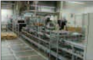
BDM Fully Automatic Bundler/Wrapper