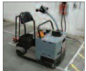
Raymond Warehouse Tug