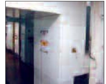
Pass-Through Oven Systems