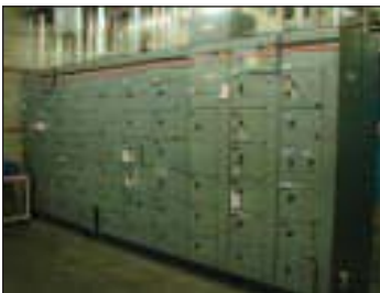
GE Spectra Series, Cutler Hammer Unitrol & Westinghouse Sub Station Switch Gear