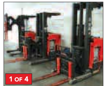
(4) Raymond 3,000# Reach-Fork Trucks