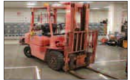
Toyota 5,000# Forklift