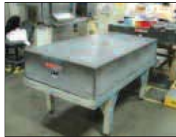
Granite Surface Plates