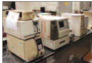
Waters Dual Absorption Detector