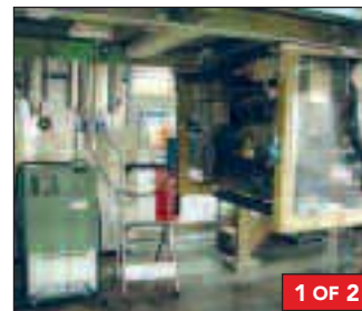
(2) Sherman Surface Treating Systems