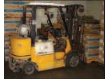
Halla 3,000# Forklift