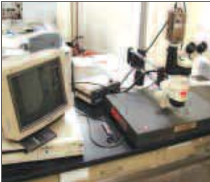
View of Microscopes