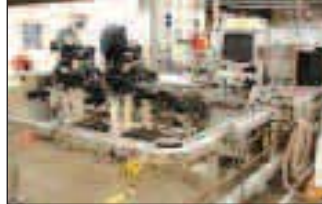
Brady Thermal Labelers