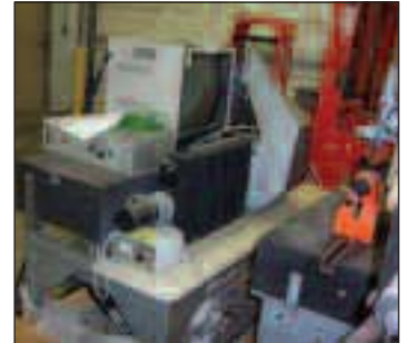
Wenzel Coordinate Measuring Machine