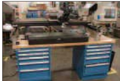
Nikon Imaging Microscope