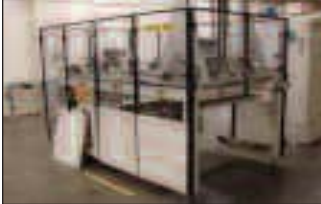
Gruppo PRB Palletizing Machine