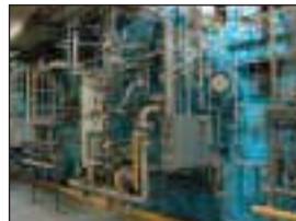
Nebraska Steam Boiler