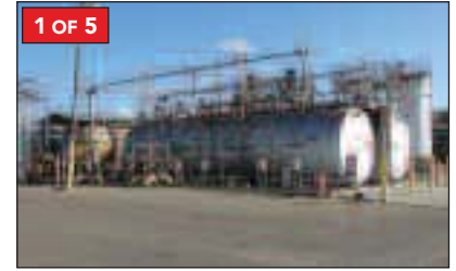
(5) 20,000 Gallon Horizontal Storage Tanks