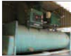
York 600 Ton Water Type Chiller