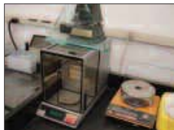
Mettler Lab Scales