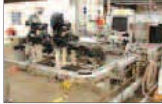
Brady Thermal Labelers