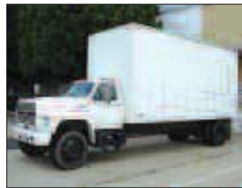
Ford F-800 20' Box Truck