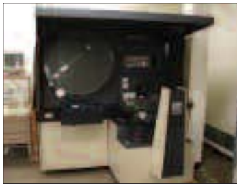
Optical Gaging Products Optical Comparator