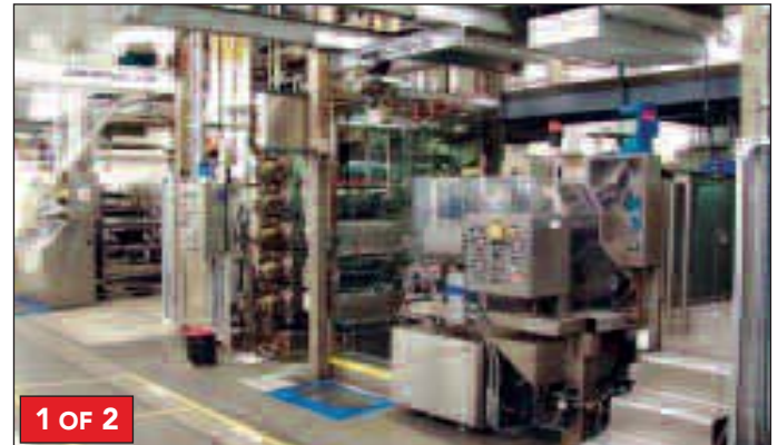
(2) 27-1/2" Wide Magnetic Media Coating Lines

(2) 27-1/2" WIDE MAGNETIC MEDIA COATING LINES, Including: (2) Sherman Surface Treating Systems, Mdl. 6X40R, S/N's 406210 & 400096, Temperature Controlled Surface Treating, Accuweb Steering & Tension Controls, Intrinsically Safe Controls, Faustel Winder, S/N 04908-01, Black Clawson Roll Changer, Mdl. ROLLCHGR, S/N 366060, Calendar Rolls, Pass-Through Oven Systems, Coating Heads, Explosion Proof Conduit & Fittings, Unrollers, Splicers, Ovens, Wonder Ware Control Systems, Mezzanine, Walkways, (27+) Netzsch 20, 60 & 200 Liter Wet Batch Media Milling Machines, Ross Double Planetary Mixer, Hydro Pac Powered High Pressure Solids Homogenizers, Mdl. MUF 34, Hydro Pac Powered High Pressure Impingement Type Solids Homogenizers, Mdl. IMUF 37, Emco Cowles Dissolver, Mdl. W-14-10, S/N LA-623, Myres Portable Mixer, w/100 Gal. Kettle, 300, 350, 450 & 800 Gallon Mixing Kettles, w/Hockmeyer & Philadelphia Mixers, Flexicon Material Feeder Systems, PLC Controllers & Cabinets for Media Mills & Mixers, Explosion Proof Valves, Conduit & Fittings, (2) 1,800 F.P.M. Slitting/Winding System, including, Pancake Handling kiosks, Winder Stations, Slitter Head & Wipe Stations, Burnishing & Pull Roll Stations, Unwind Tension Stations, Methods Engineering 1/4" Tape Processor, Mdl. M16-101, S/N 15088603, w/Mitutoyo Laser Scan Micrometer, Verity Systems Bulk Degausser, Magnetic Media Test Stations, Spare Calendar Rolls, w/Racks, Mixing Stations, Pumps, Spare Parts