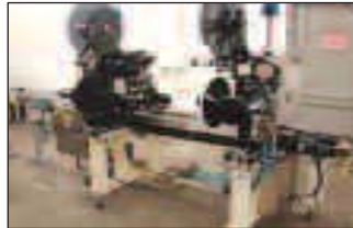
Weber Label Makers