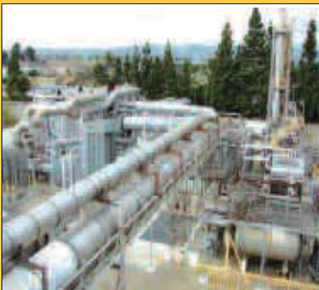
State of the Art Solvent Recovery System