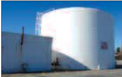
300,000 Gallon Water Storage Tank