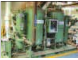
Cooper Turbocompressor Desiccant Air Dryer