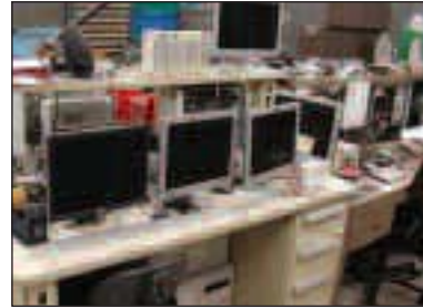
View Lab Equipment