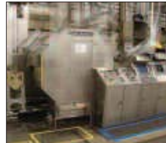
Black Clawson Roll Changer