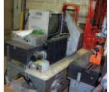
Wenzel Coordinate Measuring Machine