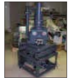
Cambridge Imaging Microscope