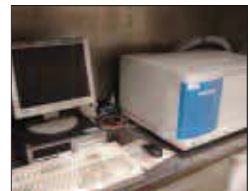
Huriba Laser Particle Analyzer