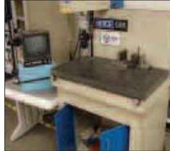
Boice Coordinate Measuring Machine