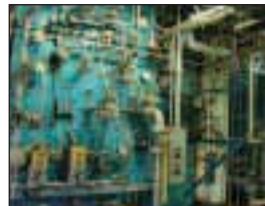
Murray Iron Works Steam Boiler