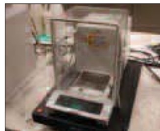
Mettler Lab Scales