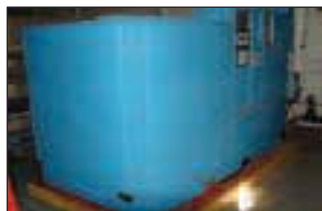
Atlas Copco Air Compressor