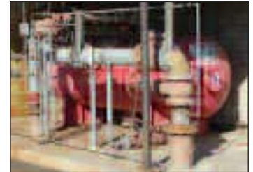
Light Water Storage Systems