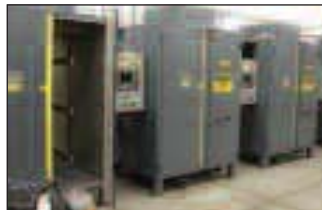
Sahara Industries Ovens & Drum Hot Boxes