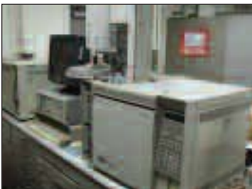
Hewlett Packard Gas Chromatographs