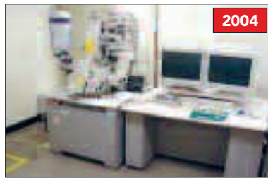
Hitachi Scanning Electron Microscope

2004 HITACHI SCANNING ELECTRON MICROSCOPE, w/X-Ray, Mdl. S-4700, S/N 6054-02 THERMO NICOLET INFRARED SAMPLING MICROSCOPE, Mdl. Continuum (25+) MITUTOYO, NIKON, CAMBRIDGE, ZEISS & LEICA IMAGING MICROSCOPES