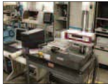
Mitutoyo Surface Tester