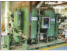
Cooper Turbocompressor Desiccant Air Dryer