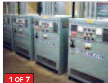
(7) Spang DC Power Supplies