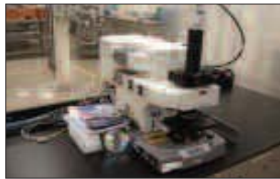
Thermo Nicolet Infrared Sampling Microscope