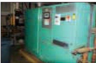
Atlas Copco Air Compressor