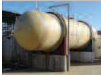
10,000 Gallon Horizontal Fiberglass Tank