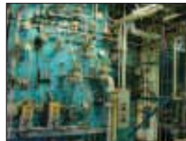
Murray Iron Works Steam Boiler