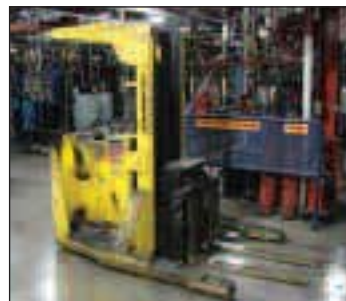
Gregory 4,000# Explosion Proof Reach Forklift

(3) 40' HAZARDOUS WASTE ROLL-OFF TRANSPORT CONTAINERS