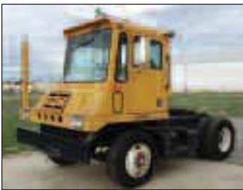
Capacity Yard Truck