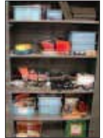
View Lab Equipment