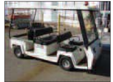
Cushman Facility Maint. Cart