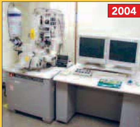
Hitachi Scanning Electron Microscope