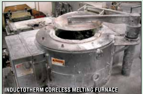
INDUCTOTHERM CORELESS MELTING FURNACE