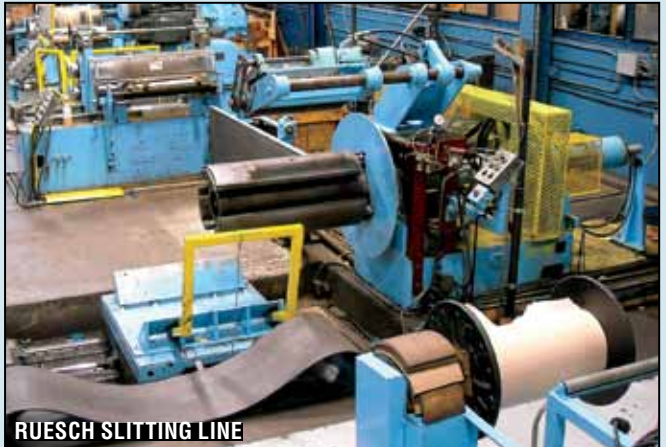
RUESCH SLITTING LINE