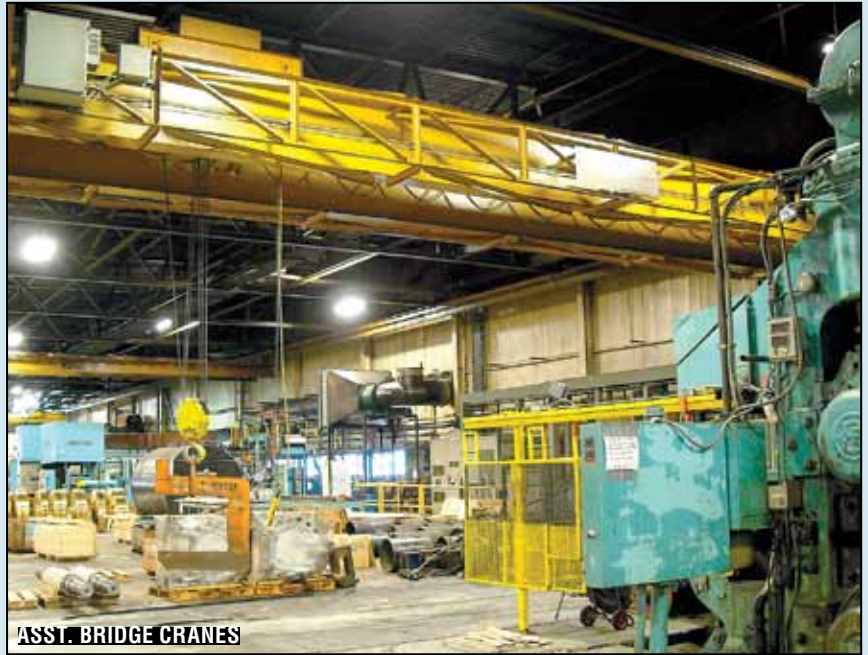
ASST. BRIDGE CRANES