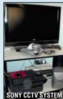
SONY CCTV SYSTEM