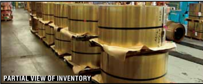
PARTIAL VIEW OF INVENTORY