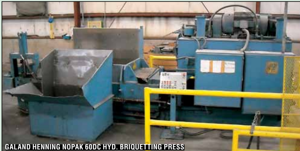
GALLAND HENNING NOPAK 60DC HYD. BRIQUETTING PRESS

(1980) GALLAND HENNING NOPAK 60DC HYDRAULIC BRIQUETTING PRESS - 14" X 14" X VARIABLE BALE SIZE