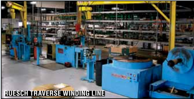
RUESCH TRAVERSE WINDING LINE