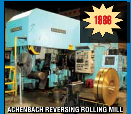
ACHENBACH REVERSING ROLLING MILL