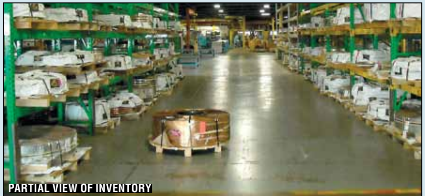
PARTIAL VIEW OF INVENTORY