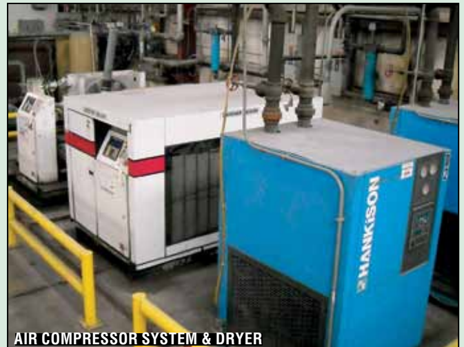
AIR COMPRESSOR SYSTEM & DRYER