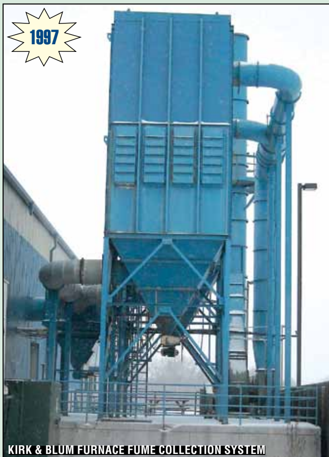
KIRK & BLUM FURNACE FUME COLLECTION SYSTEM