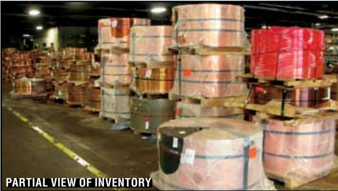
PARTIAL VIEW OF INVENTORY