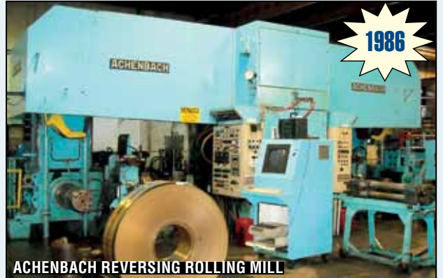
ACHENBACH REVERSING ROLLING MILL

CHAVANNE-BRUN REVERSING 4-HI COLD ROLLING MILL, ENTRY GAUGE - 0.250", FINAL GAUGE - 0.010", STRIP WIDTH 28", COIL WEIGHT - 15,000 LB. CAP., ROLLING SPEED 800 FPM; WORK ROLL MAX. 11.250" DIA.; BACK-UP ROLL DIA. 30.000", ROLLER BEARINGS; ELECTRIC DC MOTOR DRIVE – 800 HP DC, MILL CONTROL CONSOLE, VOLLMER THICKNESS GAUGES AND MOTORIZED SCREWDOWN