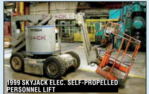
1999 SKYJACK ELEC. SELF-PROPELLED PERSONNEL LIFT