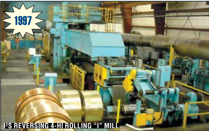
I 2 S REVERSING 4-HI ROLLING "I" MILL