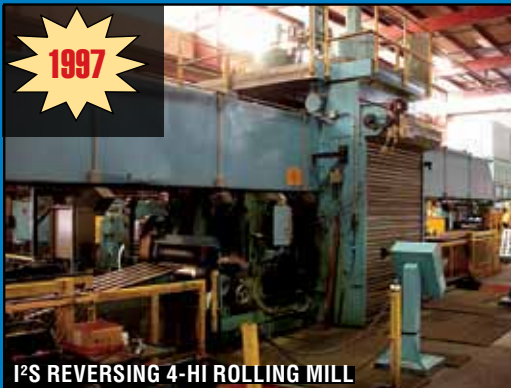
1997 REVERSING 4-HI ROLLING MILL