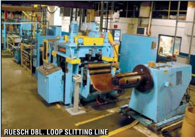
RUESCH DBL. LOOP SLITTING LINE

YODER LOOP "BULL" SLITTING LINE - 1,000 FPM, 24", 15,000 LB. CAP., 75 HP, UNCOILER, SCRAP WINDER, REWINDER, EQUIPMENT TURNSTILE, CONTROLS