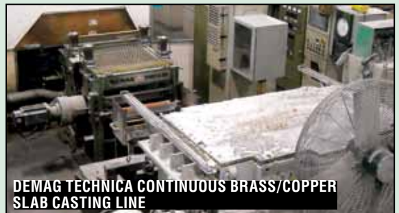
DEMAG TECHNICA CONTINUOUS BRASS/COPPER SLAB CASTING LINE

(2) CARRIER FCS-31/70420 RAIL MTD. VIBRATORY CHARGING HOPPERS 4' X 8' X 30"