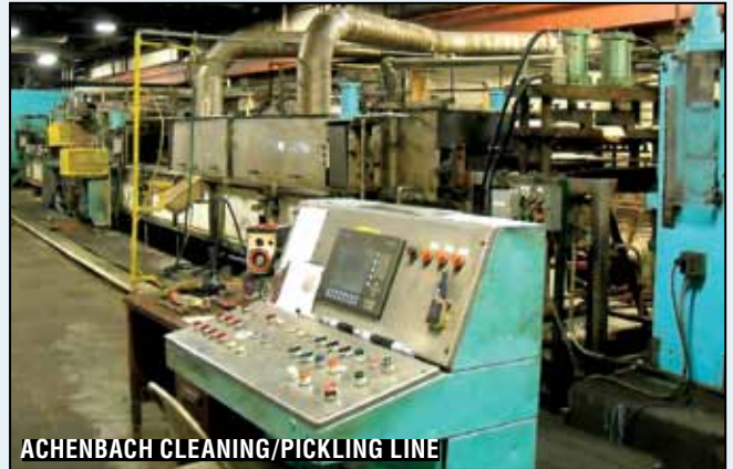
ACHENBACH CLEANING/PICKLING LINE

(2) RUESCH TRAVERSE WINDING LINES - 16", LINE MOD 3158/59, HORIZONTAL UNCOILER, GUILD DMA-100-3 BUTT WELDER; 300 AMP; TECHMET 135-01 LASER SCANNING OPTICAL MICROMETER "SIDEWINDER" MICROPROCESSOR CONTROLS