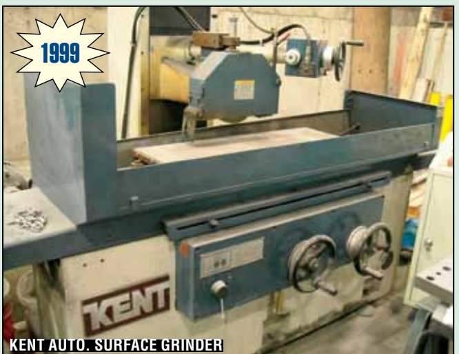
KENT AUTO. SURFACE GRINDER