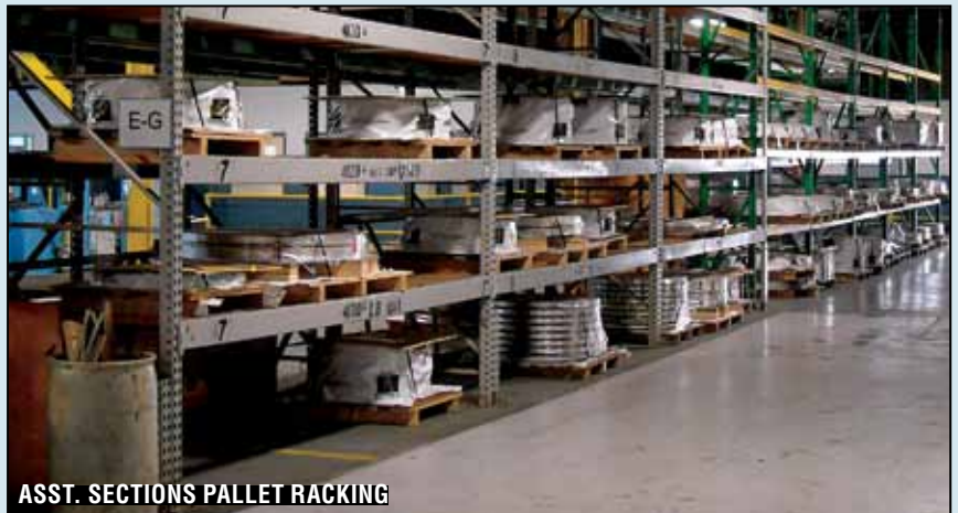
ASST. SECTIONS PALLET RACKING