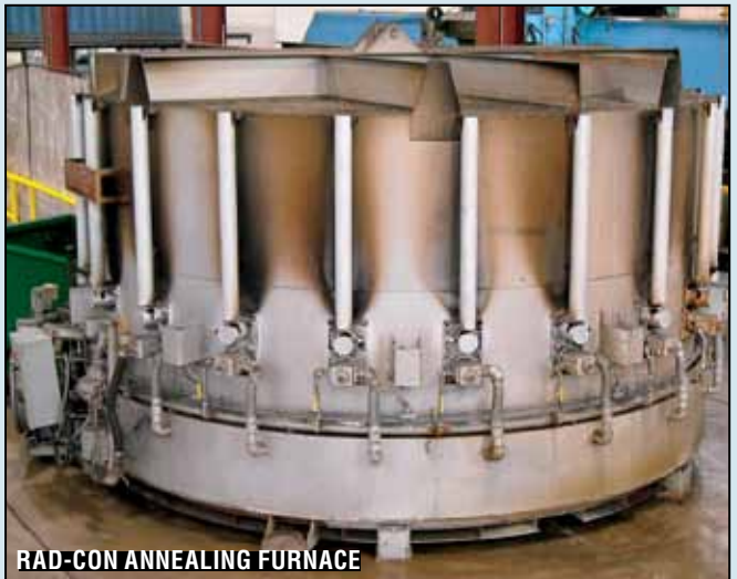
RAD-CON ANNEALING FURNACE

(1986) ANNEALING FURNACE W/GAS FIRED BELL FURNACE - 1,400°F, 132" DIA. X 66"H W/(3) COVERS; (3) BASES; PROGRAMMABLE TEMPERATURE CONTROLS