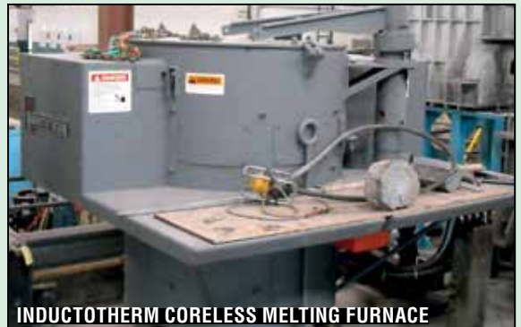
INDUCTOTHERM CORELESS MELTING FURNACE