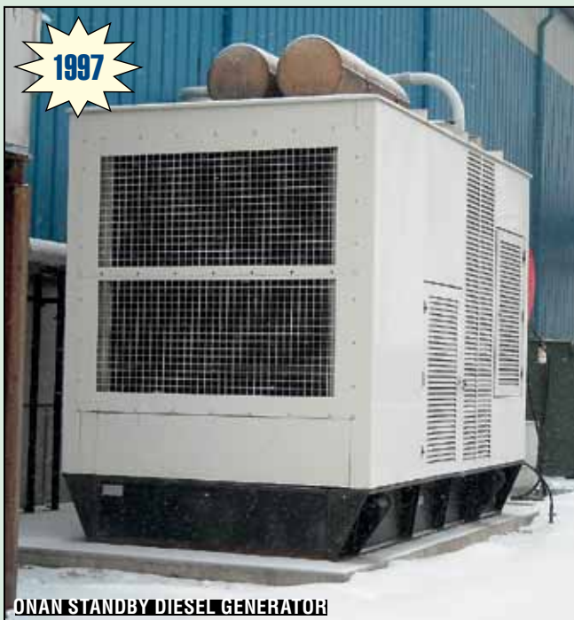
ONAN STANDBY DIESEL GENERATOR