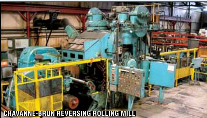
CHAVANNE-BRUN REVERSING ROLLING MILL