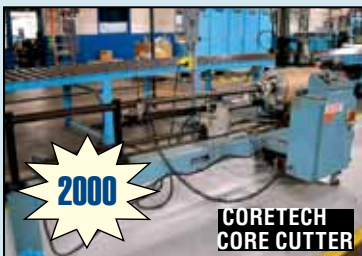
CORETECH CORE CUTTER

(1985) CONTROL COOLING SYSTEM FOR ALL FURNACES AND COVERS W/(2) EVAPCO LST-5-91 COOLING TOWERS - APPROX. 200 TON CAP., 10' X 6' X 10'H; (3) BLOWERS; (2) COOLING TOWERS - APPROX. 75 TON CAP. STEEL HOUSING ON STEEL LEGS (2) CHILL TANKS - APPROX. 1,000 GAL. CAP. AND PUMPS