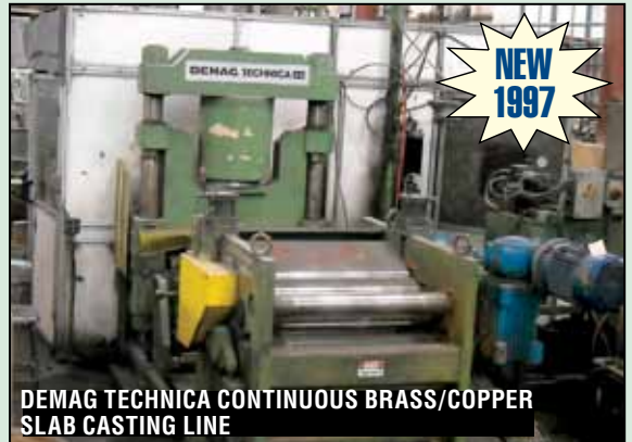
DEMAG TECHNICA CONTINUOUS BRASS/COPPER SLAB CASTING LINE